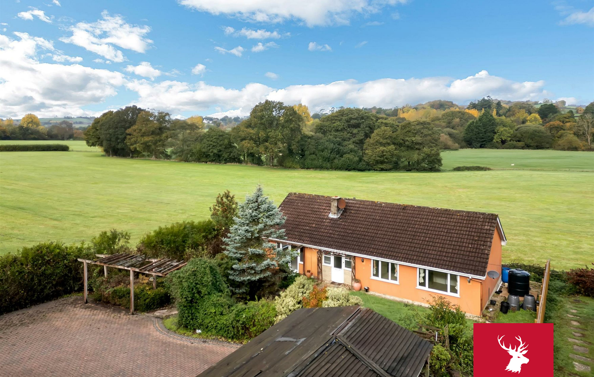
The Bungalow Nags Head Road